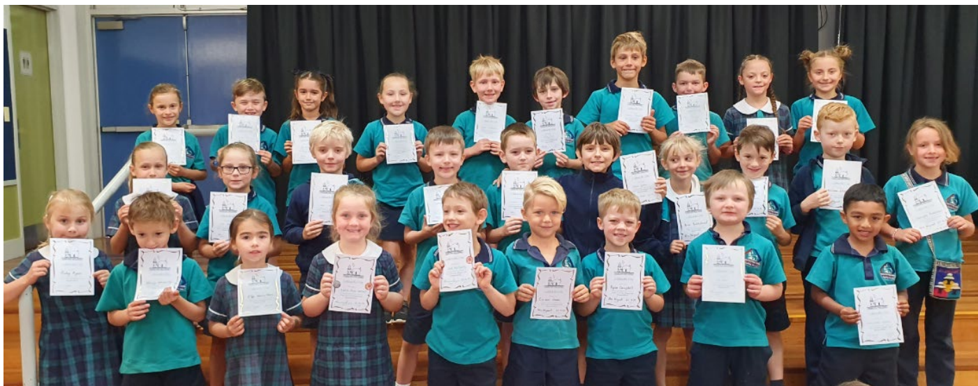
K-2 Lighting the Way awards, Week 1