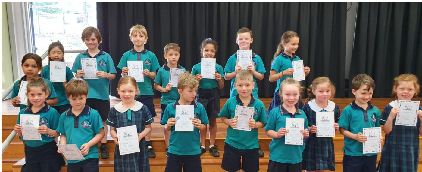
K-2 Lighting the Way awards, Week 2