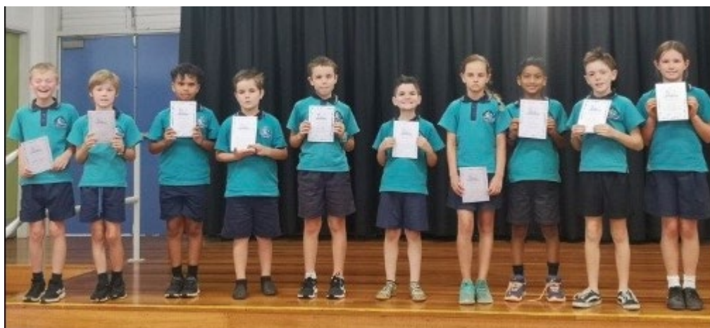
Stage 2 Lighting the Way awards, Week 1