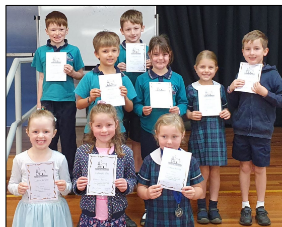
K-2 Lighting the Way awards, Week 8