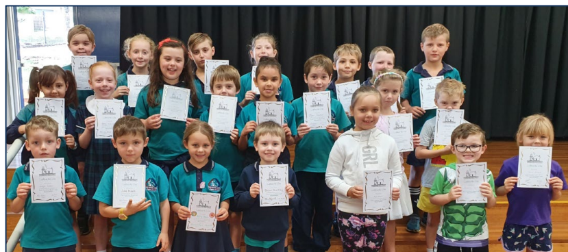
K-2 Lighting the Way awards, Week 9